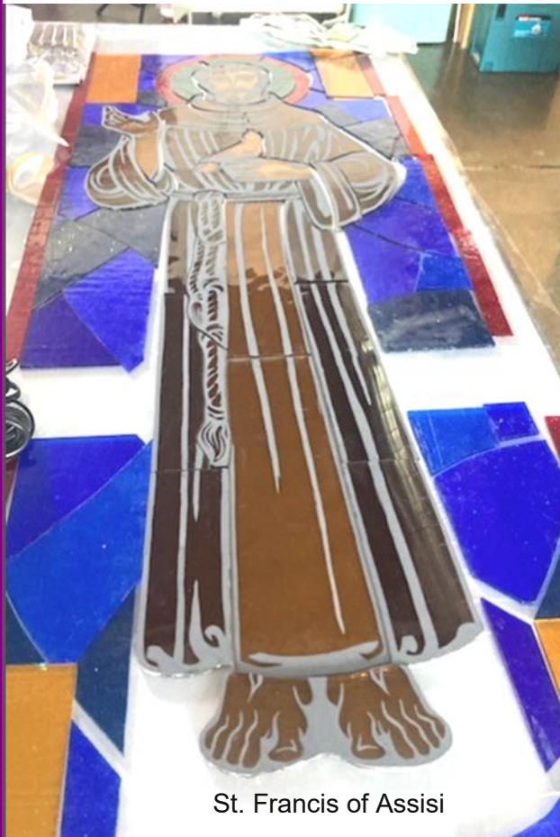
St. Francis of Assisi

St. Francis is almost done. Each week we will share another picture of our new stained glass windows as they are being assembled. The plan is to install them sometime in September. We will have a special ceremony and celebration when everything is complete.