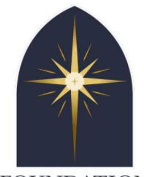
FOUNDATION for the Diocese of Helena