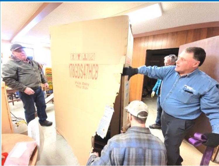
The new cooler arrived early and took some manhandling to get into position. The Knights spent Monday night tearing down the rest of the old cooler and making the space ready for painting and power. The space is