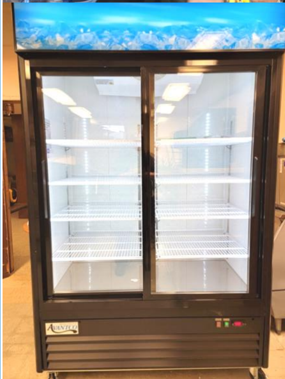
now ready for a fresh coat of paint and some electrical work to support the new cooler. The space will be used on March 18 th when the Deer Lodge Development group will be holding their second annual fundraising gala with a full bar and five course dinner.