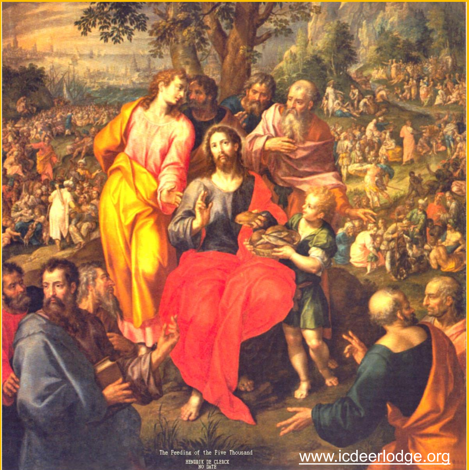
The Feeding of the Five Thousand HENDRIK DE CLERCK NO DATE

July 25 th – 17 th Sunday in Ordinary Time