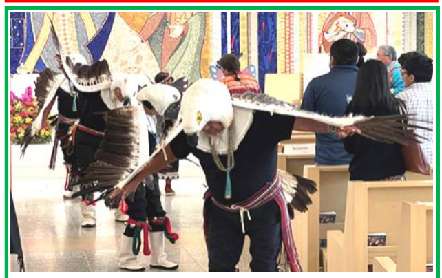
Last Call for Black & Indian Mission donations. Envelopes available in the back of the Church.

All proceeds to benefit the missionary speakers this week?