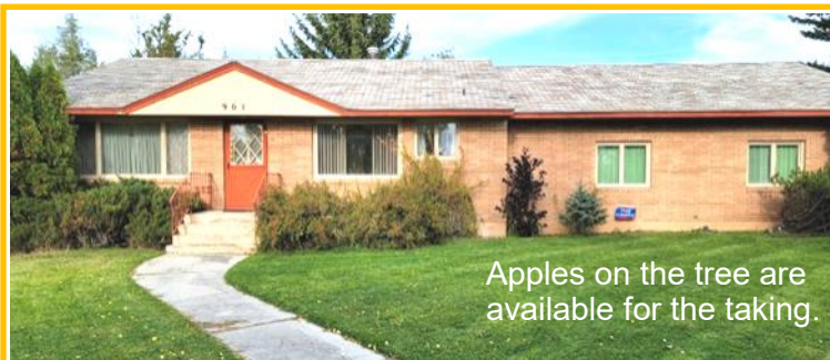
Apples on the tree are available for the taking.

We will be doing the annual Parish Census counts the next 3 weekends in our parishes across the Diocese. IC's numbers have gone down 32% since 2014 and St. Theo's have gone up 17%. Hopefully we be able to fill the church more than usual the next few weeks.